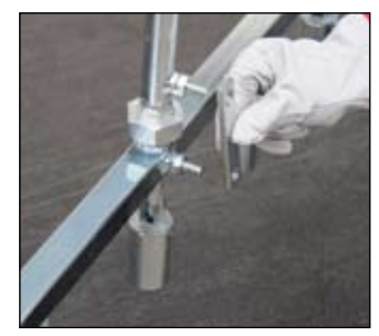
3. Insert the safety bracket