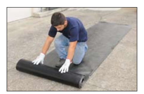
1. Unroll the modified bitumen membrane, cut it and put it straight