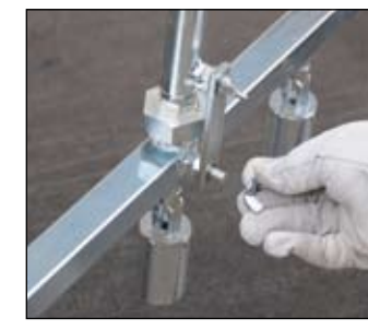
4. Fix the safety bracket with the wing nuts