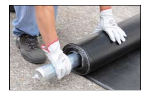
3. Insert the iron roller into the roll