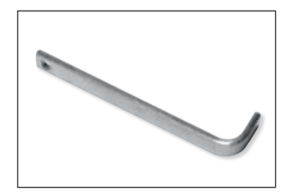
46 mm spanner for multi-head torch roofing tool Code 1015.CMA