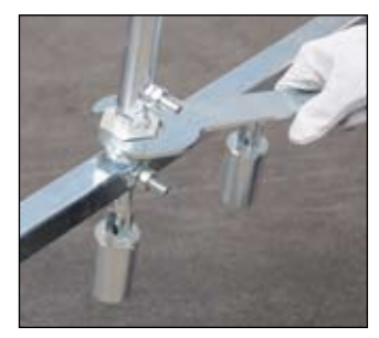
2. Tighten the handle with the 46 mm spanner