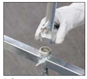
1. Connect the main handle to the seven-head bar